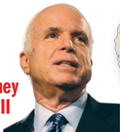
John Sidney McCain II

AGE 72 BIRTH DATE Aug. 29, 1936 LOCATION Panama Canal Zone