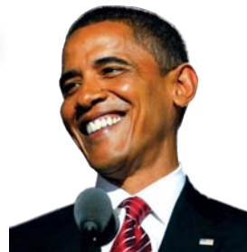
Barack Hussein Obama Jr.

AGE 47 BIRTH DATE Aug. 4, 1961 LOCATION Honolulu